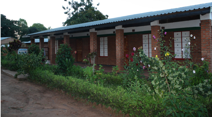
Flowers growing outside the school