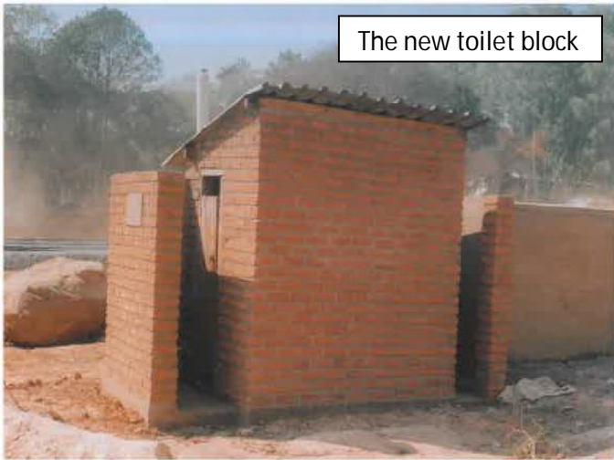
The new toilet block