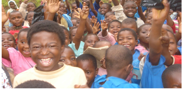
A warm welcome from the local children